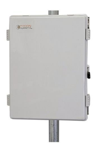
UPSPro® Polycarbonate Enclosure