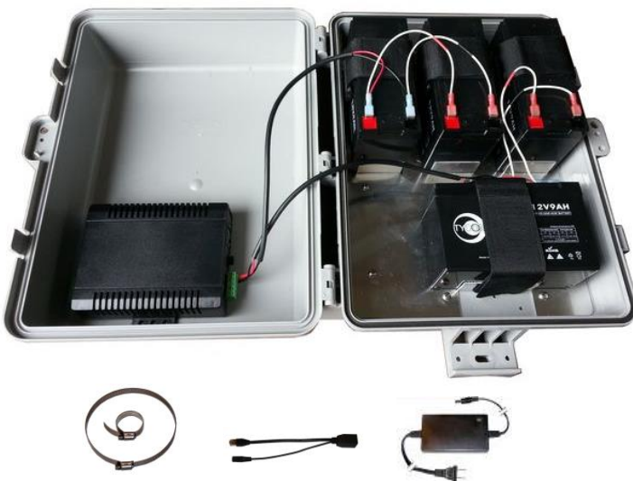
UPSPRO® Polycarbonate Enclosure System