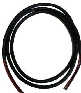
Outdoor Rated Cable