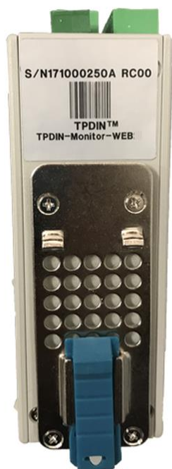
TPDIN® DIN Rail Attachment