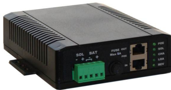
TP-SCPOE-2424-HP Charge Controller