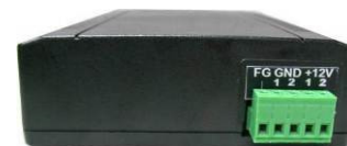
Back panel view