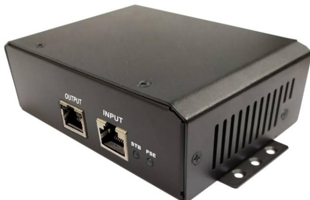
TP-DC-1256GD-BT w/ Metal Housing