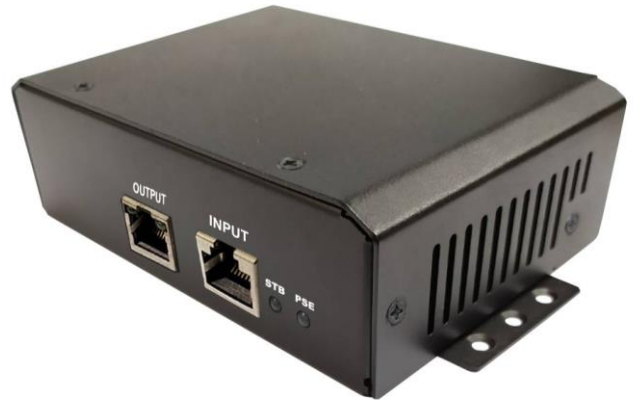
TP-DC-1256GD-BT w/ Metal Housing