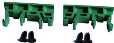
DIN Rail Adapters Included