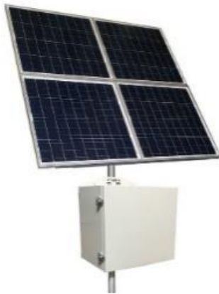
RPSTL 340W 4 Panel Solar System