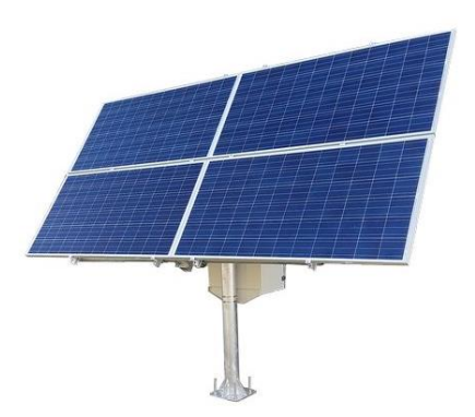
RPSTL 1.4KW 4 Panel Solar System