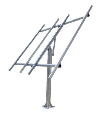
1.4KW 4 Panel Solar Mount – 10-65 deg Tilt, ground mount