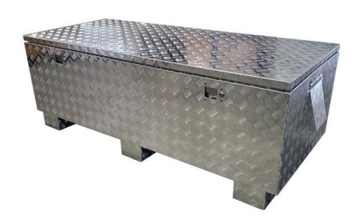
RPAL Diamond Plate Aluminum Ground Mount