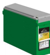
AGM 12V 180Ah Battery