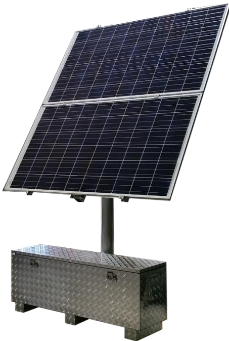
RPAL 720W Solar System