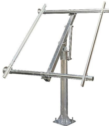
720W Solar Mount - 10-65 deg Tilt, ground mount