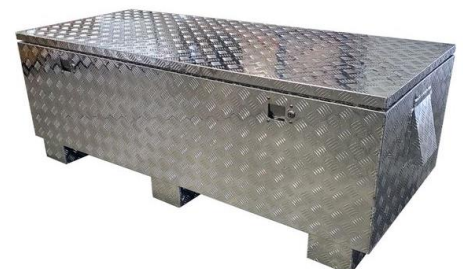
RPAL Diamond Plate Aluminum Ground Mount