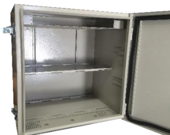
RPSTL Enclosure interior without batteries or controller