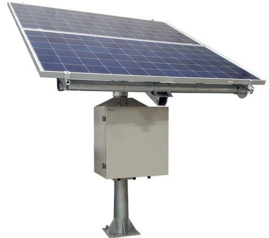
RPSTL 720W Solar System