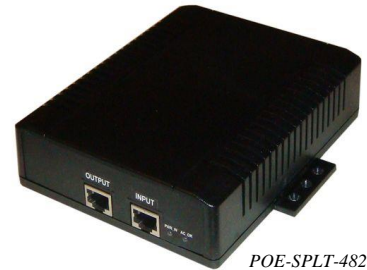
POE-SPLT-4824AC-GBT PoE Converter/Splitter