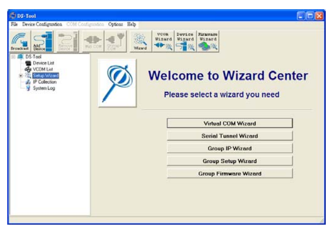
Monitoring and Configuration interface