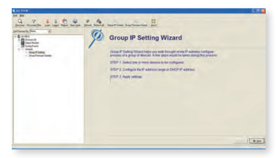
Monitoring and Configuration interface