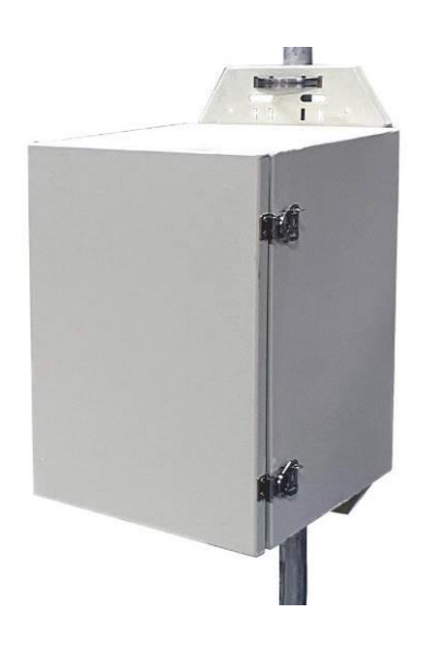
ENC-AL-21x14x15 Aluminum Enclosure