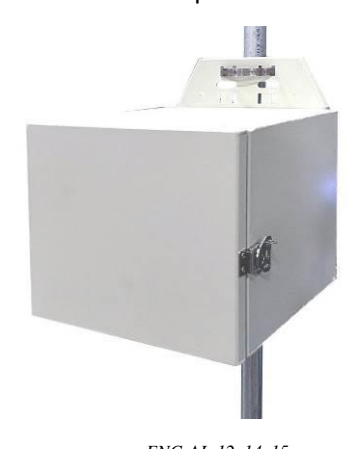
ENC-AL-12x14x15 Aluminum Enclosure

The enclosure is corrosion resistant for long service life. Enclosure material is powder coated aluminum. All hardware is stainless steel.