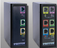
Ruggedized CL1314R & MDE