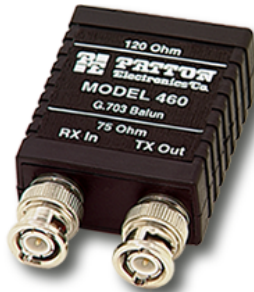
Model 460 G.703 Balun, 2 Mbps (75-Ohm to 120-Ohm)