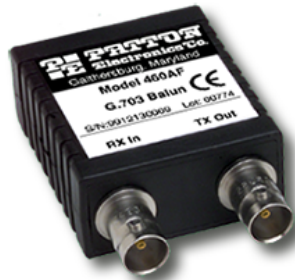
Model 465 G.703 Balun, 2 Mbps (1.6/5.6 Connectors)