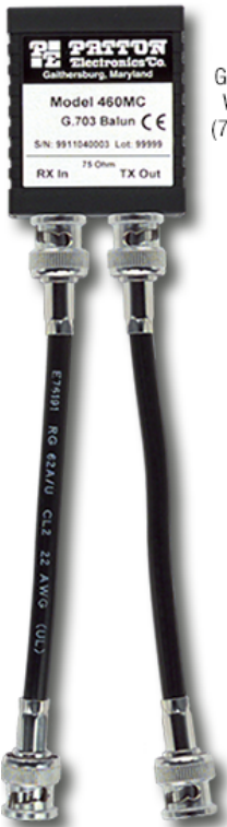
Model 460MC G.703 Balun, 2 Mbps, With Built-in Cables (75-Ohm to 120-Ohm)