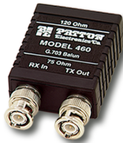
Model 460 G.703 Balun, 2 Mbps (75-Ohm to 120-Ohm)