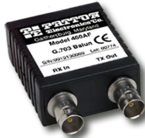
Model 465 G.703 Balun, 2 Mbps (1.6/5.6 Connectors)