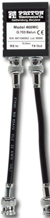
Model 460MC G.703 Balun, 2 Mbps, With Built-in Cables (75-Ohm to 120-Ohm)