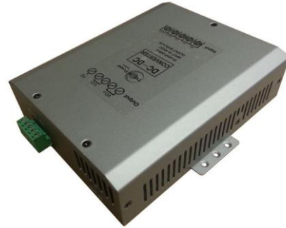
TP-VRHP-2456-5 250W Converter