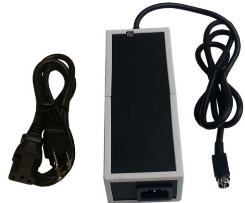
180W DIN Connector Model